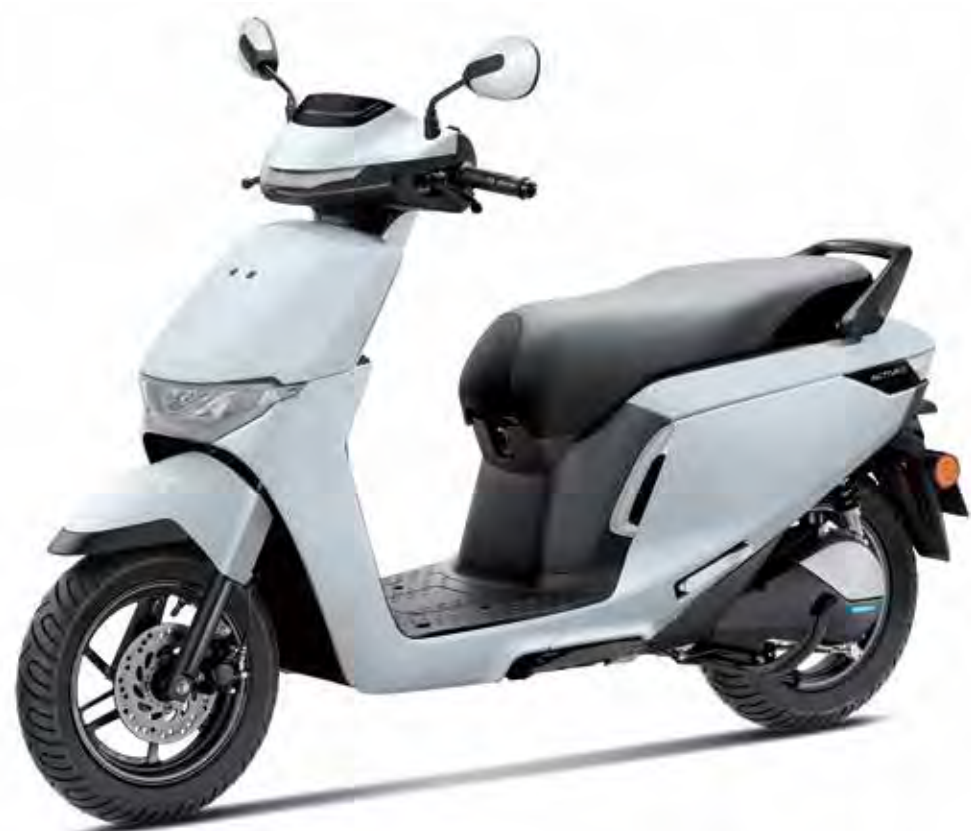
Pearl Misty White

*Products shown in the pictures may vary from actual products available in the market. All features and colours may not be part of all variants. Accessories shown in the pictures are not part of standard equipment. For creative visualisation only.