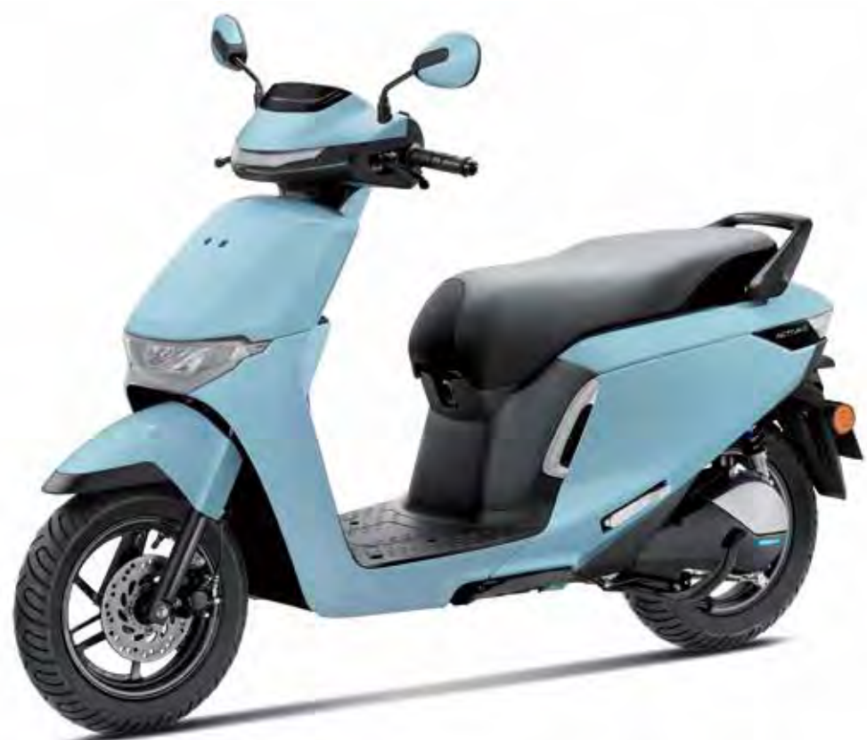
Pearl Shallow Blue

Choose the shade that complements your vibe.