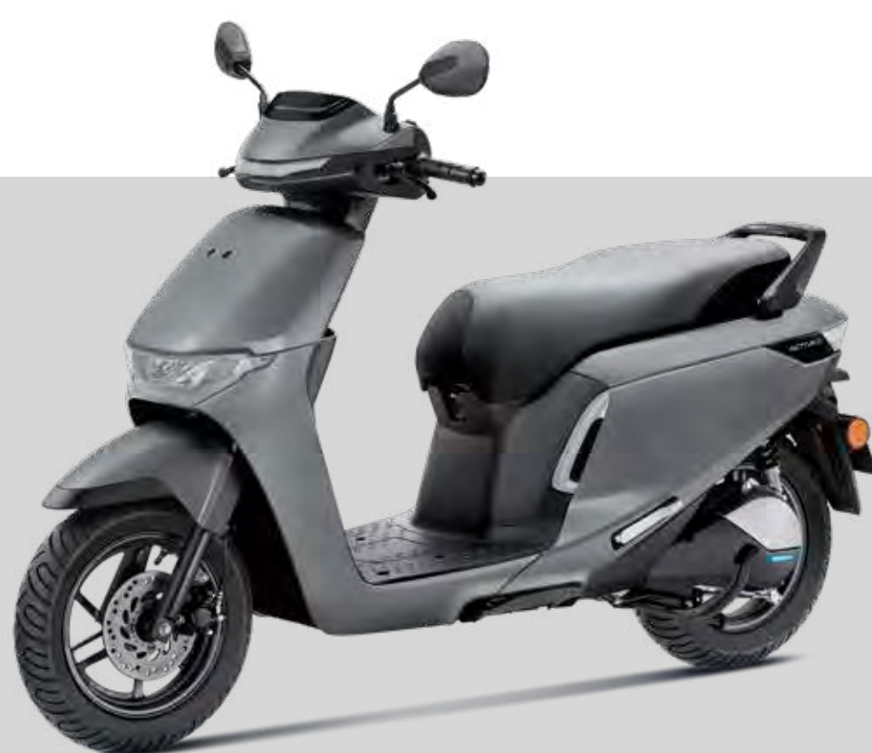
Matt Foggy Silver Metallic